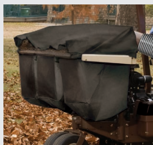
Model 12F Triple Bag Model 12HT (not shown)