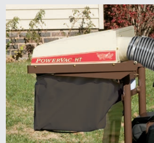
Model 8HT Twin Bag Model 8F (not shown)