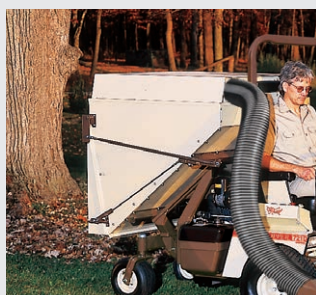
Model 25 Fixed Mount

Weight is distributed across six tires for a lighter footprint requiring no counterweight.