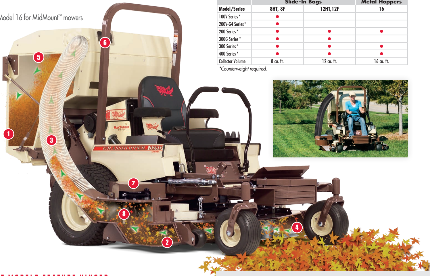
Model 16 for MidMount™ mowers