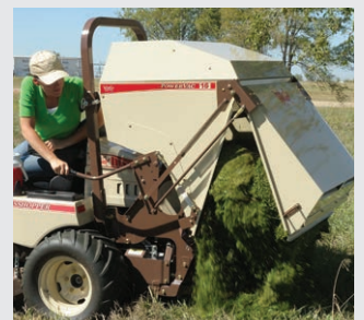
Model 16 • All 200, 300 & 400 Series