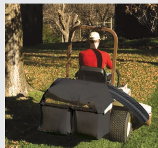
Model 8F Twin Bag Model 8HT (not shown) • All MidMount™ Series