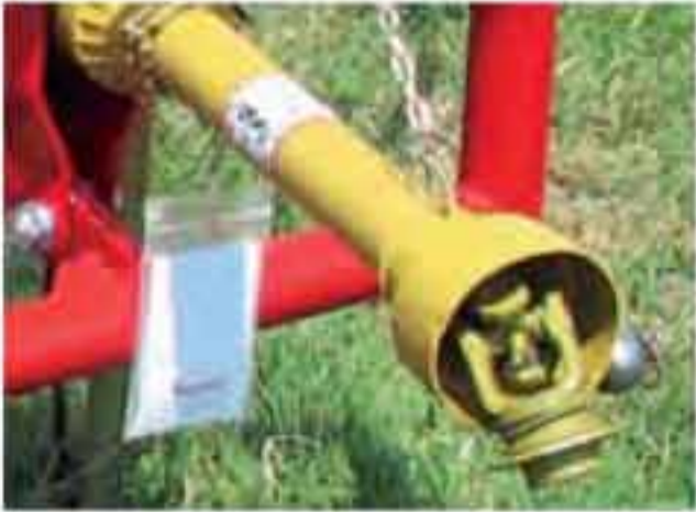
PTO Shaft with safety couplings.

Tonutti offers a large range of tedders with all kinds of features to adapt to every farmers needs and conditions. For an exact idea of the various models please have a look at the chart on the back of this brochure.