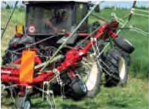
Models GTH 380 to GTH 780 are also available in hydraulic fold versions.