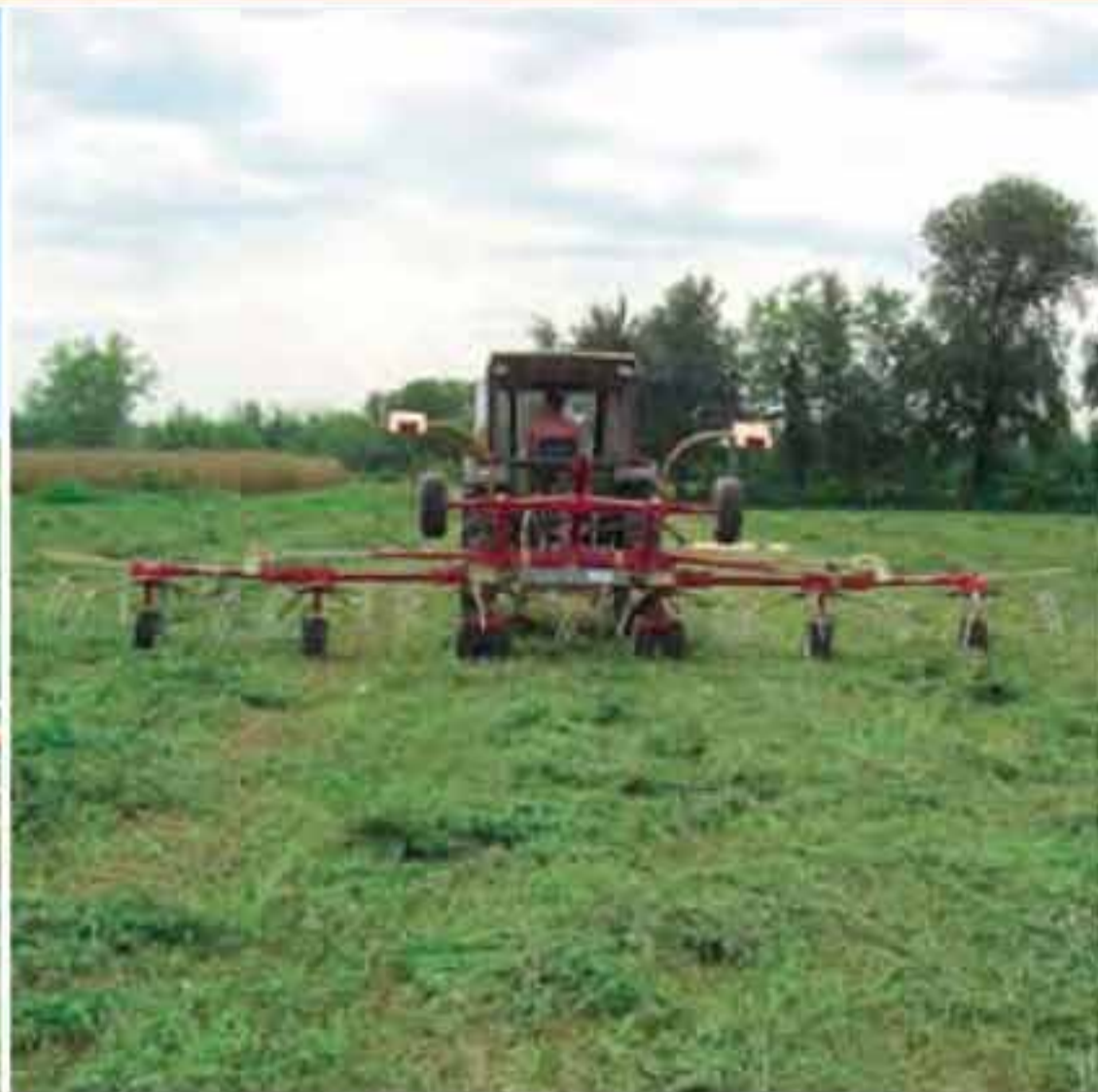
GTH 780 Opened

TONUTTI since 1864 continues today as a worldwide leading producer of a complete line of hay equipment,