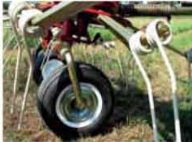
Quality 9,5 mm tires manufactured by Tonutti on models up to 540. As an Option, a specially treated, premium tire is also available. These premium fracture resistance tires are standard on the GTH 660 models.