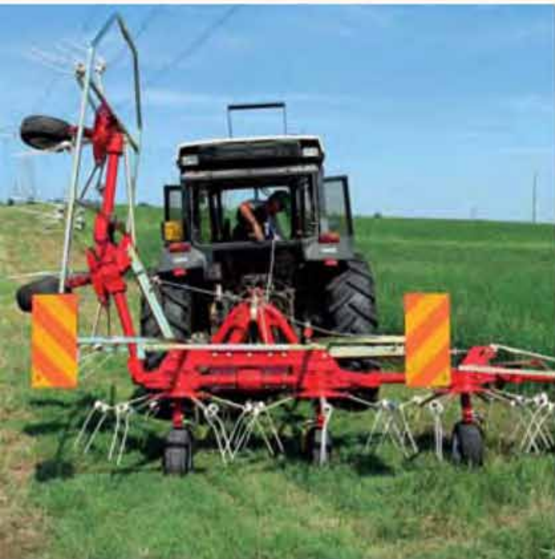
GTH 660 Opened