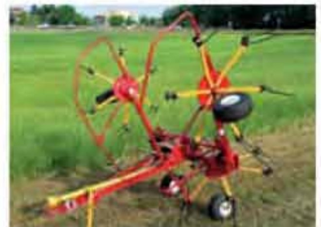
Pull Type versions are available for models