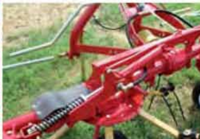
Model GT 400 with three point hitch has available an optional hydraulic kit to quickly