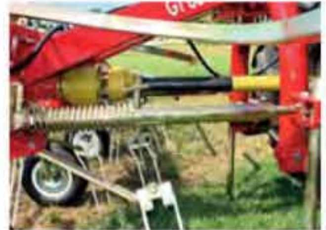
An optional mechanical shock absorber is available for all models with Off-Set 3Point Hitch and is standard on GTH 660.