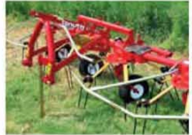
A Fixed 3 Point Hitch on the smaller tedder models 250 to 440 gives better stability while working on inclines or in mountain areas.