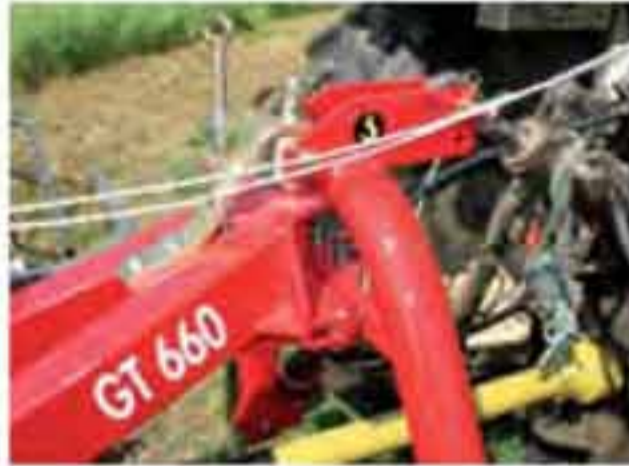
Off-Set 3 Point Hitch available for models GTH 440/500/540 and 660 which offers better manoeuvrability behind the tractor.